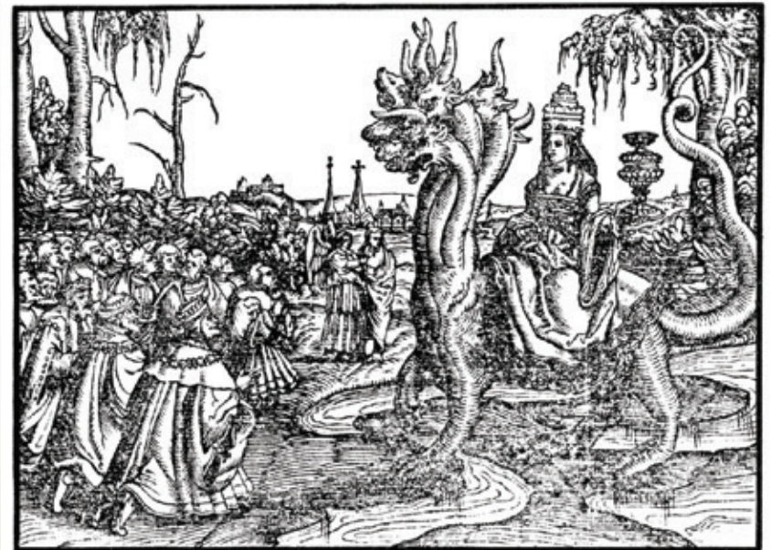
(From Luther's German Translation of 1534)

Luther maintained this was a prophecy about the antichrist Roman Church. To make this clear, even for those who were illiterate, Luther placed a woodcut (i.e., an image printed from a design cut in a block of wood) in his German translation of the Bible. Take a close look at the woman in the woodcut.