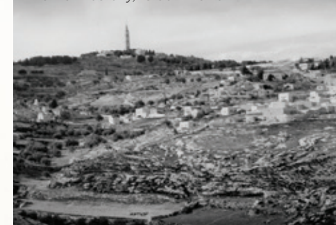
View of Bethany, Israel - 1940*

These things he said, and after that he said to them, “Our friend Lazarus sleeps, but I go that I may wake him up.” Then his disciples said, “Lord, if he sleeps he will get well.” However, Jesus spoke of his death, but they thought that he was speaking about taking rest in sleep. Then Jesus said to them plainly, “Lazarus is dead.” (11:11-14)